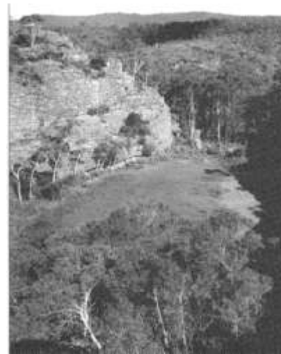
The swamp at Gooches Crater will be starved of water if mining proceeds underneath.

Despite three EIS reports, the Gooches Crater wonderland has not been assessed for protection. The Colong Foundation considers that the mining lease issued without the required EIS is unlawful, but this question has not been tested before the court. (We are unclear on just how much red tape the miners have cut away.) Centennial Coal should protect Gooches Crater rather than start mining and risk being stopped by determined opposition.